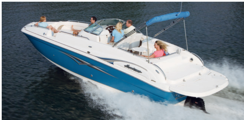
CIRCLE #160 ON P. 187 FOR BUYING INFO

The new Aqua color is festive without being garish and classy without being dull.