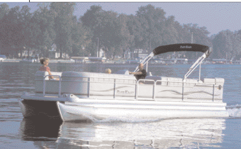
Admiral 240 RE